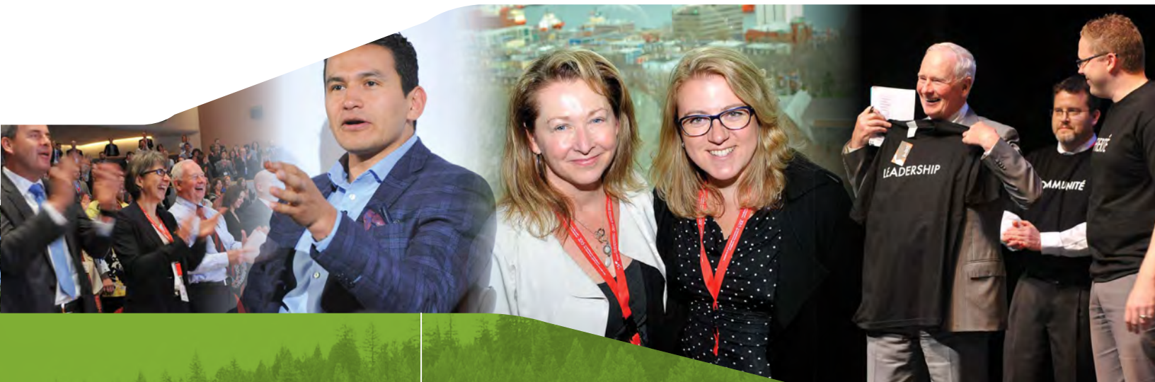
NAHEED NENSHI (2008) MAYOR OF CALGARY

In a 2016 survey of all Conference alumni, 98% said they had recommended the Conference to others, 89% said the experience helped their development as leaders and 91% said the Conference had a lasting impact on their lives.